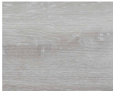
SILVER SMOKE OAK