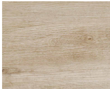
KILN DRIED OAK